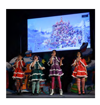
Summer Circus VBS